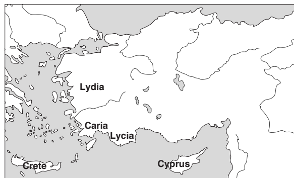
Figure 1. Anatolia, showing Lydia, Lydia, and Caria

The two scripts proposed here are all ultimately derived from Greek, and were used to represent some Indo-European languages of Anatolia. Unlike the family of Old Italic scripts (Etruscan, Oscan, Umbrian, Faliscan, North Picene, South Picene, and Messapic), however, the Anatolian scripts have unique repertoires, shapes, and character properties, and it is not appropriate to unify them in a single “Anatolian” script. At one point in preparing this proposal I tried to make a comparison chart between the three scripts—but that exercise proved pretty much impossible to do, because the shapes and values of the different characters really don’t match up (as they do for Old Italic). Nevertheless, because they and the languages they are used for are related, it makes sense to propose them together in the proposal so that experts can review them more easily. Lycian and Lydian are simpler scripts, so I have proposed these here. A subsequent document will deal with Carian, which is more problematic and requires further research.