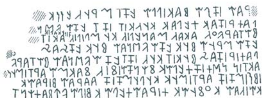
Figure 7. Lydian text from the Lydian-Aramaic bilingual, taken from Jost Gippert’s TITUS project titus.fkidg1.uni-frankfurt.de/didact/idg/anat/lydbeisp.htm .