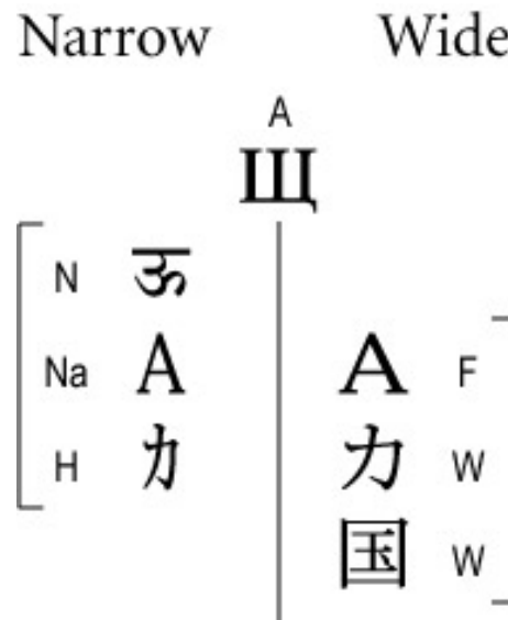
Figure 2. Examples for Each Character Class and Their Resolved Widths

In a broad sense, wide characters include W, F, and A (when in East Asian context), and narrow characters include N, Na, H, and A (when not in East Asian context).