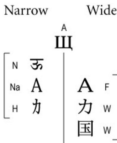
Figure 2. Examples for Each Character Class and Their Resolved Widths

In a broad sense, wide characters include W, F, and A (when in East Asian context), and narrow characters include N, Na, H, and A (when not in East Asian context).