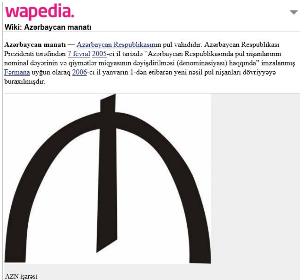
Fig. 1: From http://wapedia.mobi/az/Az%C9%99rbaycan_manat%C4%B1 (retrieved 2011-11-10).