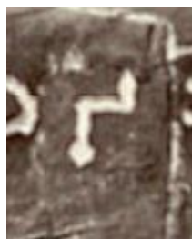
Figure 1 |a

The following images in support of this glyph change come from Garrick's photographs of paper impressions of Lauriya-Ararāj pillar.