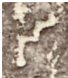
Figure 2 |i