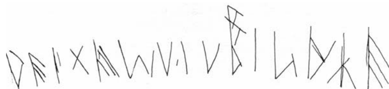
Figure 3. Example from Morandi 1982:199 showing OLD ITALIC LETTER SOUTHERN TSE.

The text in an Old Italic font: ΛΑΣΡΑ ΦΙΡΙΜΑΤΙΜΑΥΕ ΥΙ ΚΑΜΙΥΑΜΥ The text in a North Italic font: ΛΑΣΡΑ ΦΙΔΙΜΑΤΙΜΑΥΕ ΥΙ ΚΑΜΙΥΑΜΥ Text reversed for LTR display laspa firimabinaxe çi kasiçanu