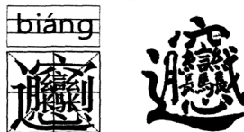
图 1 biáng 形纹样

biáng 形 (图 1) 是关中地区广泛使用的一种纹样,用于对一种关中面食的称呼。该纹样造型饱满,上下左右对称,描述了多种特定事物。面食是关中人的主要食物,我们从 biáng 形纹样的构造可以看出关中独特的生活方式及关中人民对丰衣足食、安居乐业生活的追求和向往。