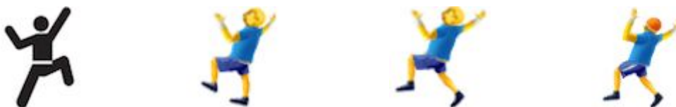
Figure 2 - Climber without background