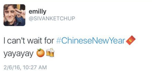
Picture 4: Example usage of Twitter's red envelope emoji for Chinese New Year 2016

RED ENVELOPE emoji-like symbols has emerged on various platforms. For example, Twitter revealed it will be releasing the first-ever Lunar New Year emoji where the RED ENVELOPE will appear during the month using special hashtags for the holiday. ( source ) On the Chinese social platform WeChat, RED ENVELOPES appear as a symbol where users can transmit them electronically via mobile payment.