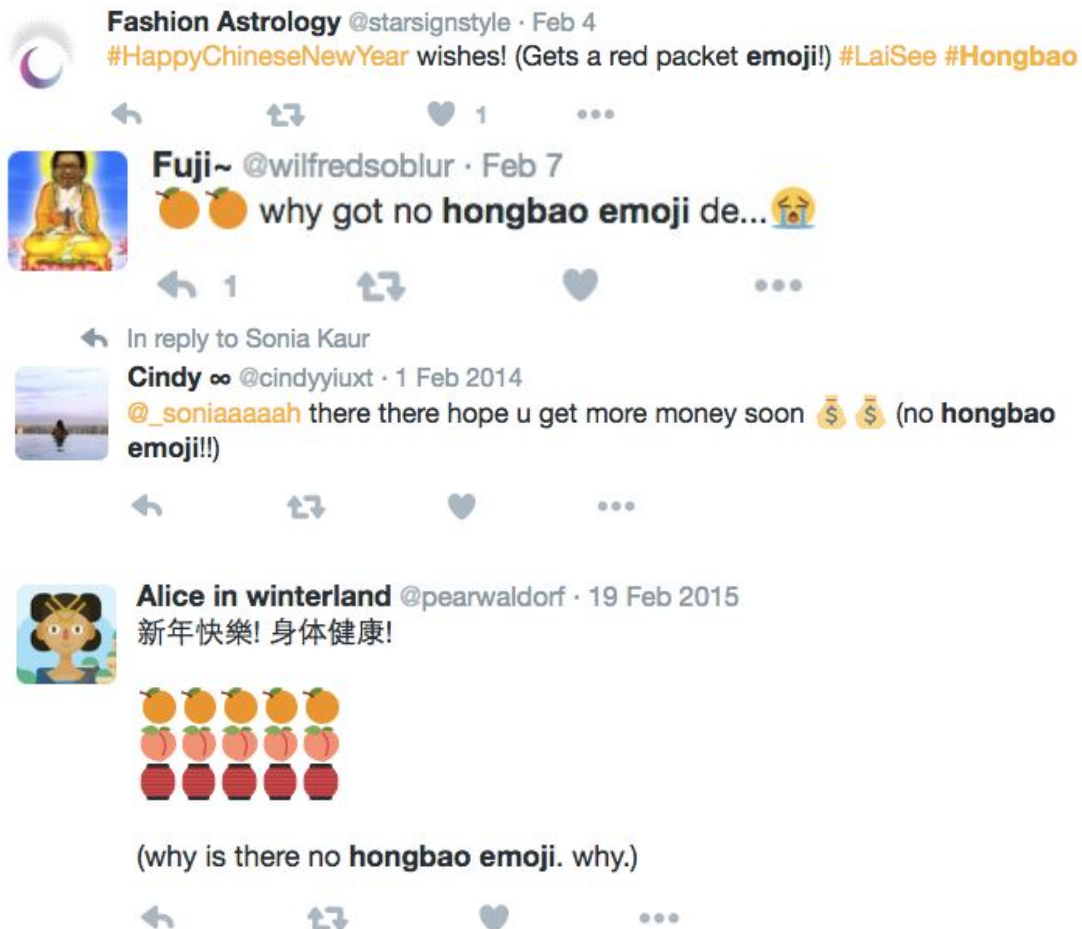
Picture 6: Requests of Red ENVELOPE emoji for Chinese New Year on Twitter

In addition to the requests from Twitter during Chinese New Year, there are a number of cases where people are demanding more emojis that better represent the Chinese population.