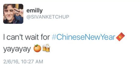
Picture 4: Example usage of Twitter's RED ENVELOPE emoji for Chinese New Year 2016

RED ENVELOPE emoji-like symbols has emerged on various platforms. For example, Twitter revealed it will be releasing the first-ever Lunar New Year emoji where the RED ENVELOPE will appear during the month using special hashtags for the holiday. ( source ) On the Chinese social platform WeChat, RED ENVELOPES appear as a symbol where users can transmit them electronically via mobile payment.