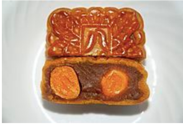
Picture 1: Traditional mooncake with lotus seed filling and salted duck egg yolk

The Mid-Autumn festival represents the second most important holiday in China after the Lunar New Year. The annual festival is held on the 15 th day of the 8 th month on the lunar calendar. ( source ) The origins of this festival dates back to Shang Dynasty (1600 – 1046 BCE) where farmers celebrate the harvest of the crops and give thanks to the Mountain Gods. ( source ) The MOONCAKE became the offering as the public worshiped the moon during every autumn's lunar. There are also various legends and folktales associated with the origins of moon cakes that have circulated. ( source )