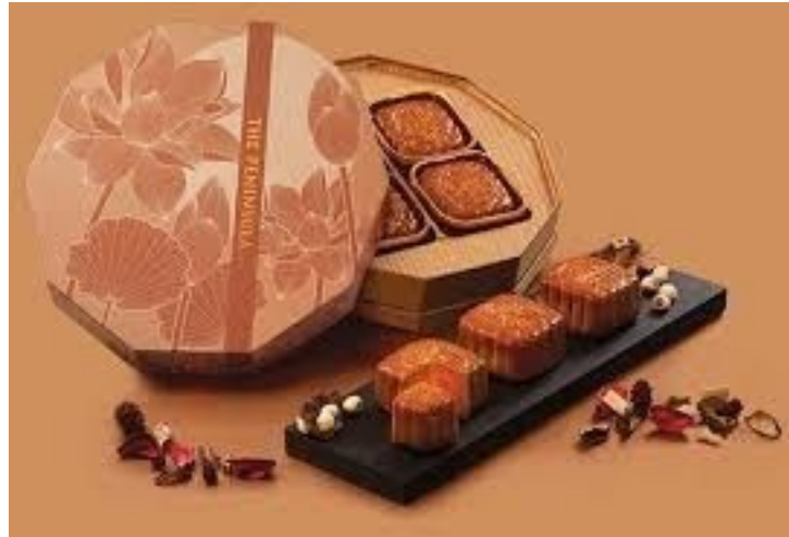
Picture 4. The Peninsula mooncake that is commonly exchanged in Asia today

and adapted their versions of the mooncake. In Vietnam, mooncakes are called Bánh Trung Thu (translates as "Mid-Autumn cake") and are sold year-round. In Vietnam the Mid-Autumn Festival is the country's second most important holiday after the Vietnamese New Year. ( source )