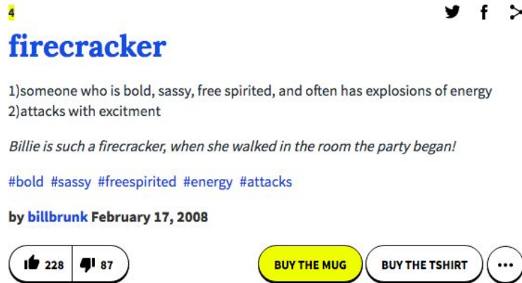
Picture 4: Urbandictionary.com explanation of the popular slang “FIRECRACKER”

purposes in the form of gunpowder. It was also later used to create fireworks, another popular celebration custom. (source)