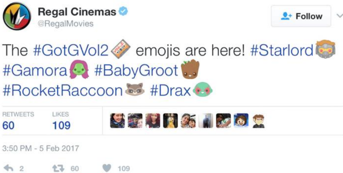
Figure 1: The raccoon emoji created for use on Twitter 4