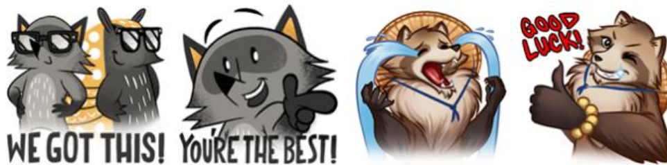
Figure 2. Examples of raccoon-themed Facebook stickers

While petitions exist to both the Unicode Consortium and one of its member companies, Apple, the lack of evidence of reliability is not conclusive evidence of its frequency of request. Instead, Facebook’s development of raccoon images for their stickers, used across the platform including its chat, suggest that the raccoon is a well-received image, and that a notable amount of interest exists for it.