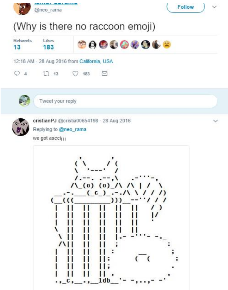
Figure 3. An example of a creative workaround to the raccoon emoji using ASCII characters

As an interesting side note, Figure 3 12 shows another example of users who have addressed the lack of a raccoon emoji in a creative and elaborate way: