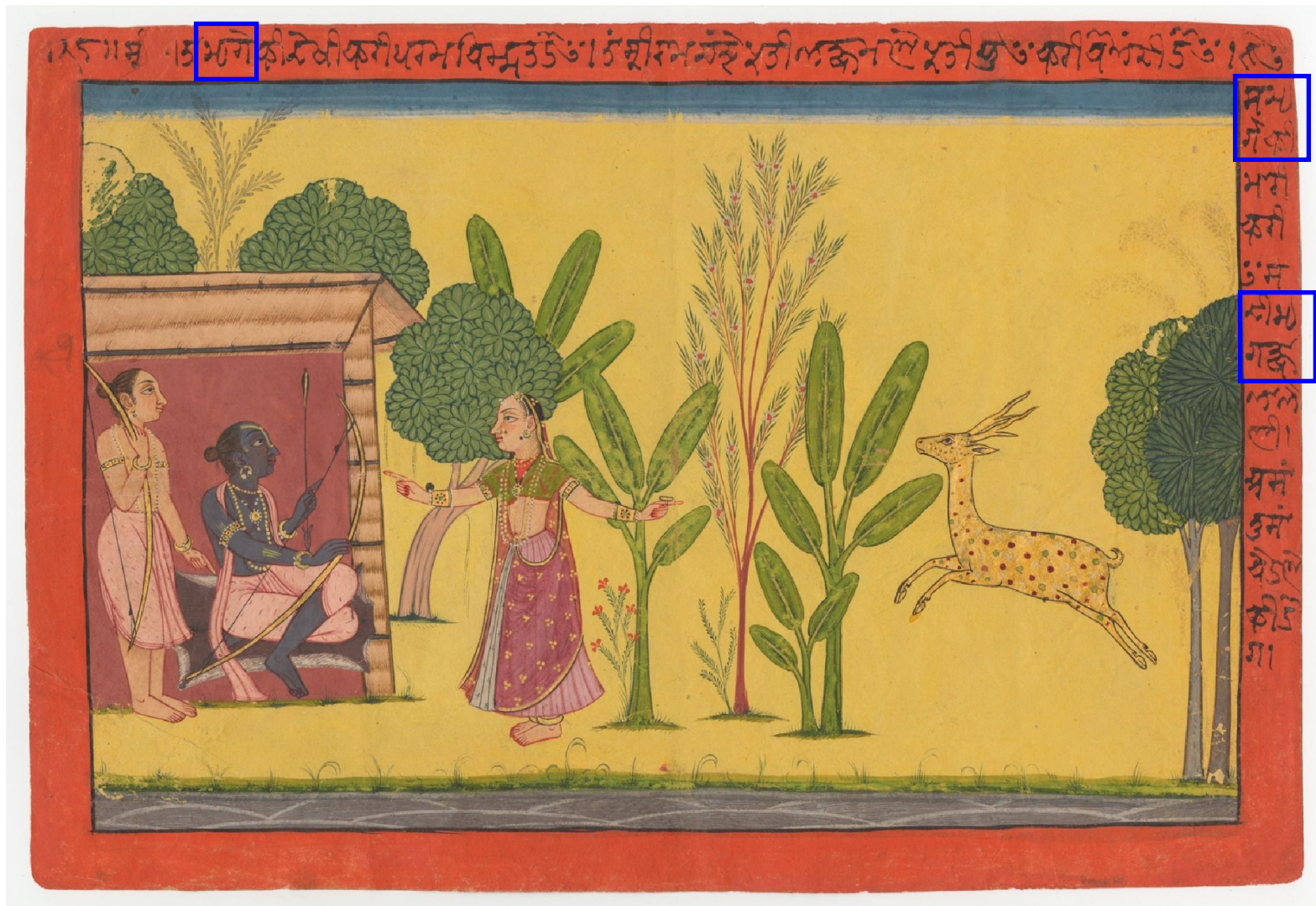
Figure 1. Sita requesting Rama to capture the Golden deer or Maricha.