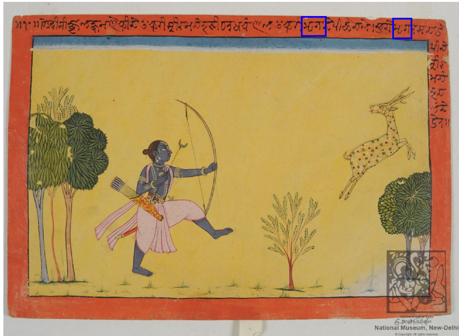
Figure 2. Rama chasing the golden deer Maricha.