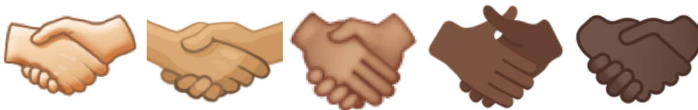
Above: Shared skin tone support is not RGI but is supported by Samsung, Facebook, WhatsApp, Google, Twitter (shown L-R above).