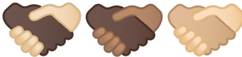
Above: Handshake shown with mixed skin tone support. Mockup based on Google emoji designs.