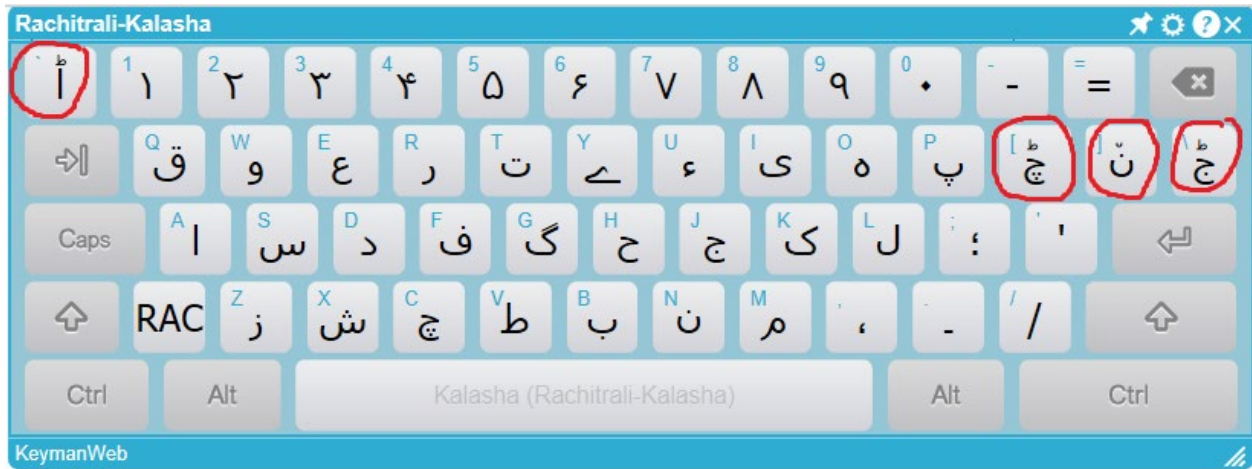
Kalasha Keyboard shifted Version