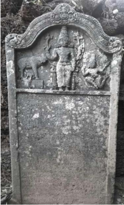
22. Kodangala inscription