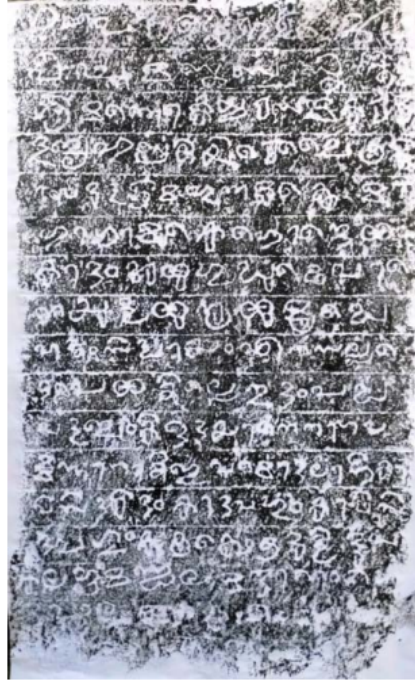
17. Gunavante inscription