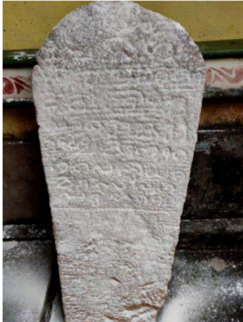
24. Eshwaramangala inscription