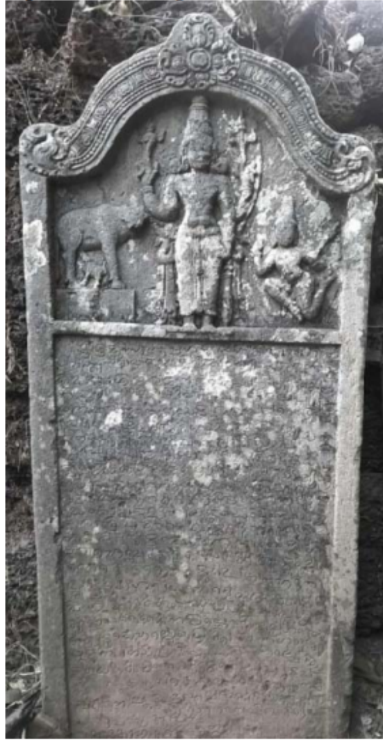
10. Parakkila Inscription