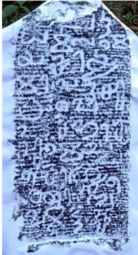
14. Kabaka inscription