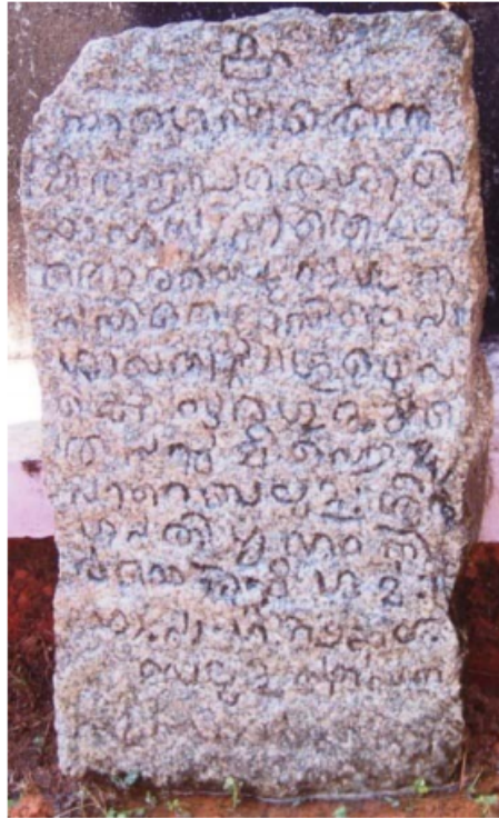
20. Kodippadi inscription