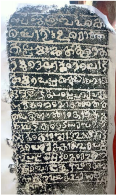
23. Ilantila inscription