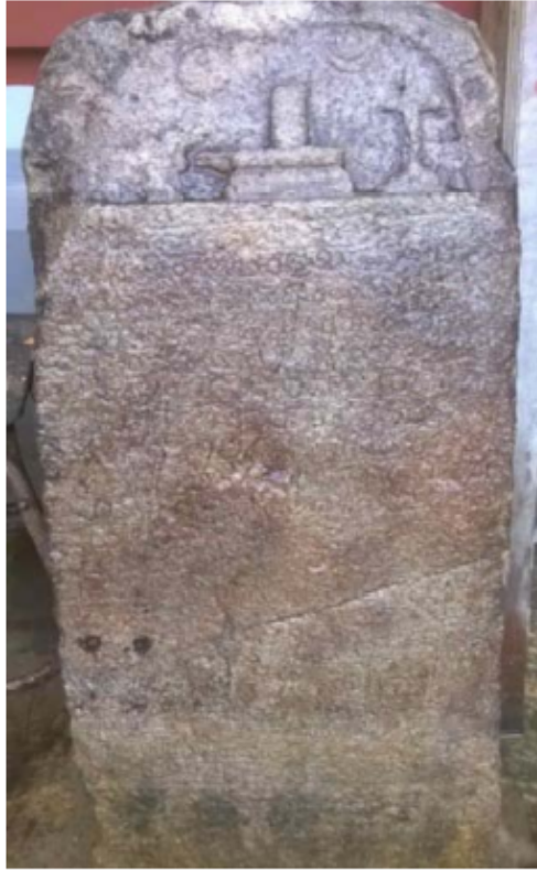
13. Padnooru Inscription