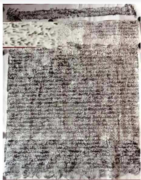
18. Kananjaru inscription