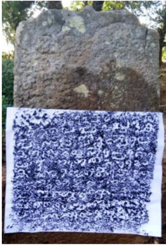
19. Manjanadi inscription