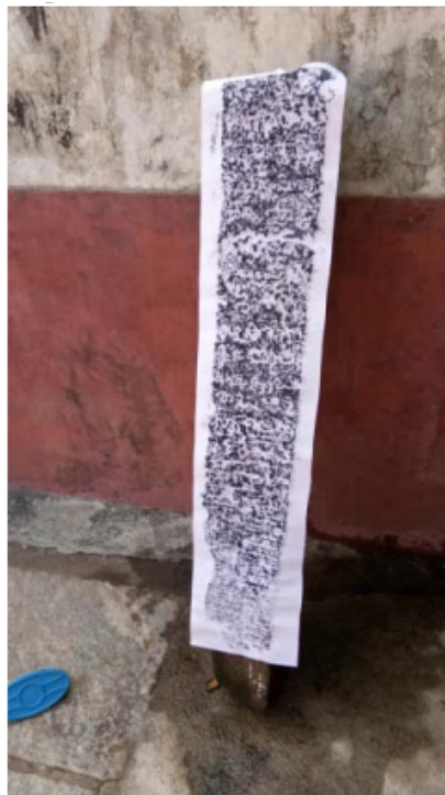
21. Kumata inscription