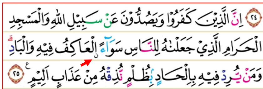
Figure 2. Showing ARABIC SMALL LOW NOON without kasra preceded with U+064B ARABIC FATHATAN. From [3] p.335