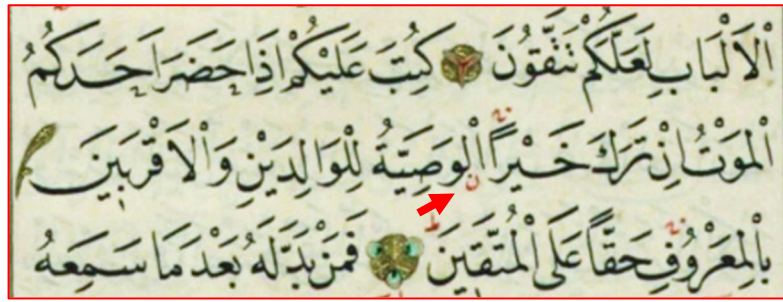
Figure 4. Showing ARABIC SMALL LOW NOON without kasra. From [6] p.33