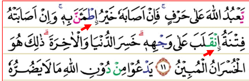
Figure 1. Showing with U+08D9 ARABIC SMALL LOW NOON WITH KASRA preceded with U+064F ARABIC DAMMA. From [3] p.333