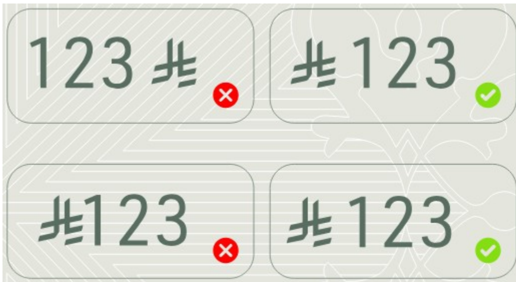
Figure 2. Saudi Central Bank (2025). Proper use of the symbol.