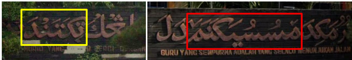
Figure 1. A wall decoration featuring Wolio and Latin scripts located at the corner of SMA Negeri 2 Bau-Bau. Note the words مُسُسِيَكَنْم [mosusuakanamo] (red box) and تَكَتَنْدَا [tekatanda] (yellow box), which respectively employ the Unicode characters ARABIC VOWEL SIGN SMALL V ABOVE and ARABIC LEFT ARROWHEAD BELOW.