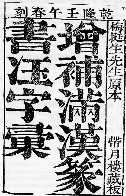
Zengbu Man-Han zhuanzihui 增補滿漢篆字彙 (RM CK494.13 166): title-page.