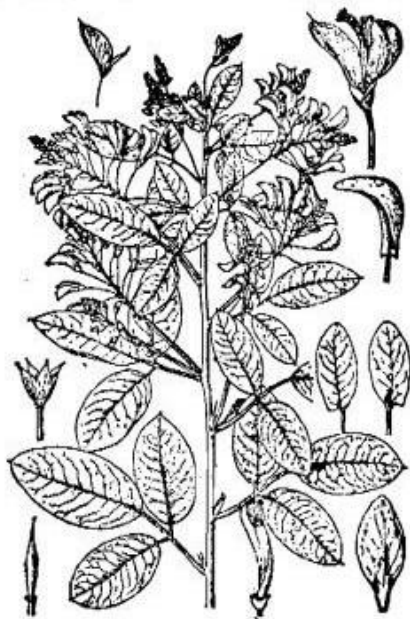
图 591 蕓子梢 Campylotropis macrocarpa

Campylotropis macrocarpa (Bge.) Rehd. in Sarg. Pl. Wils. 2:113. 1916.