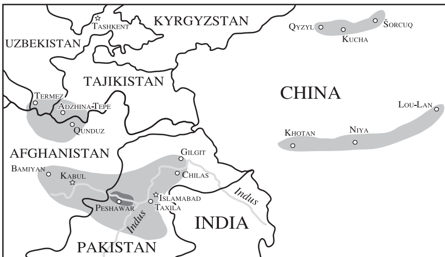
Figure 14-2. Geographical Extent of the Kharoshthi Script

The exact details of the origin of the Kharoshthi script remain obscure, but it is almost certainly related to Aramaic. The Kharoshthi script first appears in a fully developed form in the Aśokan inscriptions at Shahbazgarhi and Mansehra which have been dated to around 250 BCE. The script continued to be used in Gandhara and neighboring regions, sometimes alongside Brahmi, until around the third century CE, when it disappeared from its homeland. Kharoshthi was also used for official documents and epigraphs in the Central Asian cities of Khotan and Niya in the third and fourth centuries CE, and it appears to have survived in