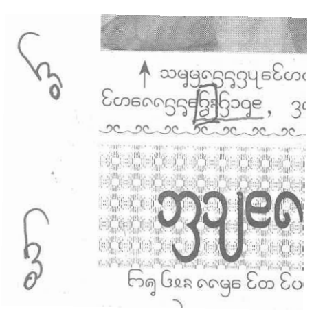
Figure 2. Example from the Xishuang Banna Daily showing SVA in print; two handwritten versions are also given.