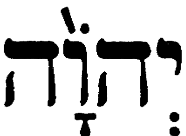
The divine name, from Genesis 3:14 BHS <<u>yod</u>, <u>sheva</u>, <u>he</u>, <u>holam</u>, <u>ZWJ</u>, <u>vav</u>, <u>qamats</u>, <u>qadma</u>, <u>he</u>> <u>Holam</u> above the right of <u>vav</u> and <u>qamats</u> below it

Exceptionally, when a collocation of \underline{holam} and \underline{vav} occurs within the divine name as written in the Bible text, i.e. in a word whose base characters are \langle \underline{vod}, \underline{he}, \underline{vav}, \underline{he} \rangle (sometimes preceded by other base characters and/or followed by \underline{maqaf} and another word), \underline{holam} may appear above the top right of \underline{vav} when there is another \underline{vowel\ point} combined with and positioned below the same \underline{vav} . See also \underline{section\ 3.1} below. Other exceptional collocations may occur in some texts.