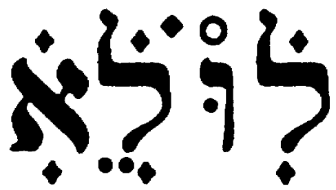
lûlē' "unless", from Psalm 27:13 BHS

A small number of words in the Hebrew Bible are marked with a special or "extraordinary" point (Latin: punctum extraordinarium ) above the word, or often but not always such a point above every letter of the word. Just one word, in Psalm 27:13, is marked by such a point both above each letter and below each letter. In BHS these points are diamond-shaped and larger than the round dots which make up many vowel points , but smaller than the accent revia ; but typographical conventions for size and positioning vary. These points are an ancient part of the Hebrew Bible text, probably predating all other points, and are commonly printed in otherwise unpointed Bible texts.