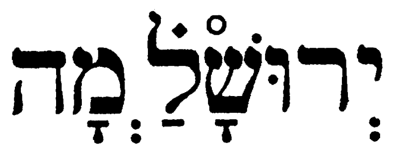
yərûšālaəmāh, the name of Jerusalem with suffixed <u>he</u>, from 1 Kings 10:2 BHS <<u>yod, sheva, resh, vav, dagesh, shin, qamats, shin dot, masora circle, lamed, patah, revia, CGJ, sheva, mem, qamats, he</u>> Sequence of <u>patah</u> and <u>sheva</u>

yərûšālaim, the name of Jerusalem, from Joshua 10:1 BHS <<u>yod, sheva, resh, vav, dagesh, shin, qamats, shin dot, lamed, patah, revia, CGJ, hiriq, final mem</u>> Sequence of <u>patah</u> and <u>hiriq</u>