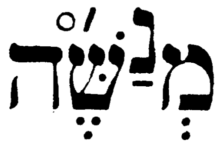
mənaššeh "Manasseh", from Judges 18:30 BHS <<u>mem, sheva,</u> <raised> <u>nun, patah</u> <\raised>, <u>shin, segol, dagesh, shin dot, geresh, masora circle, he</u>> Raised <u>nun</u>, and a six character composite character sequence in normal text

In a number of places in the Hebrew Bible unusual letter forms are traditionally used, though not all are found in all printed editions. These include enlarged letters, reduced letters and raised letters. These are semantically variant forms of the letters, and so they do not require specific representation in Unicode. These variations may be indicated by higher level formatting. There are also a few "broken" letters with variant glyphs, for which it may be necessary to add new characters to Unicode, or perhaps to define a use of variation selectors to indicate that a variant glyph is required. 28