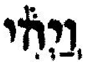
wayəhî "and it was", from Genesis 8:6 in a facsimile of the Codex Leningradensis