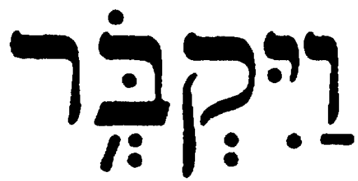
wayyiqəbəōr "and he buried" , from 2 Kings 21:26 BHS <<u>vav, patah, yod, hiriq, dagesh, gof, sheva, bet, sheva, dagesh, merkha, CGJ, holam, resh</u>> Sheva and holam with the same base character

A very few other anomalous cases are found in Hebrew Bible texts. For example, in the BHS Hebrew Bible and in the Leningrad Codex on which it is based, the fourth base character of the first word of 2 Kings 21:26 carries both <u>sheva</u> and <u>holam</u>. This was probably originally a scribal error as many manuscripts lack the <u>sheva</u>, but it has been perpetuated in a standard scholarly edition and in electronic texts based on it.