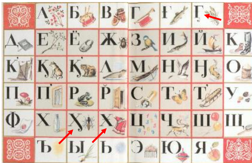
Figure 3. CYRILLIC CAPITAL LETTER GHE WITH STROKE AND HOOK, CYRILLIC CAPITAL LETTER HA WITH HOOK and CYRILLIC CAPITAL LETTER HA WITH STROKE (Bergmann, 1999) [Nivkh]