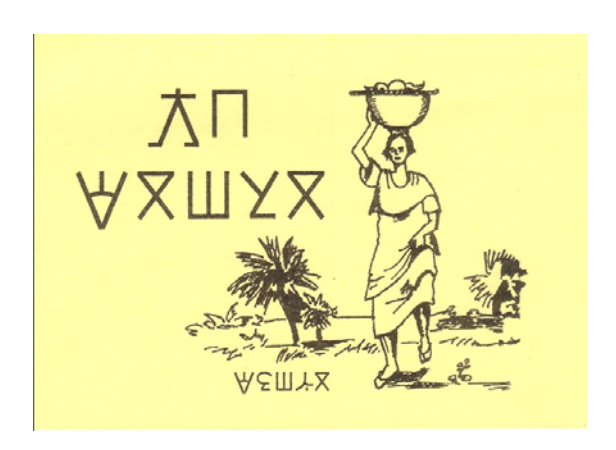
Figure 4. 太П ₩ХШҮХ (Cover)