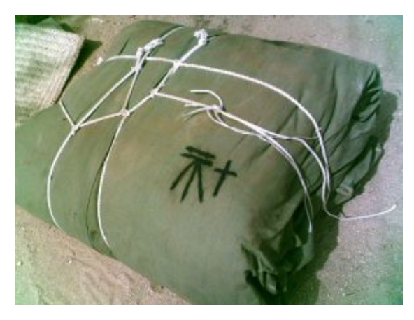
Figure 2. Beria Giray Erfe family marking