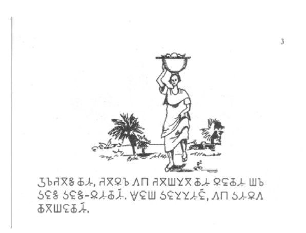
Figure 5. ДП ₩ХШҮХ (Page 3)