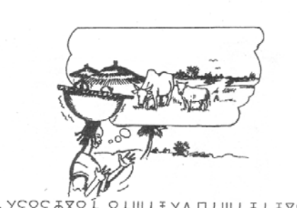
Figure 6. 大П ₩ХШҮХ (Page 4)