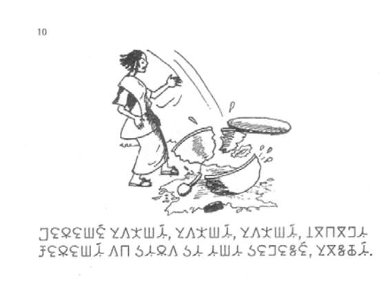
Figure 8. ДП ₩ХШҮХ (Page 10)<sup>2</sup>