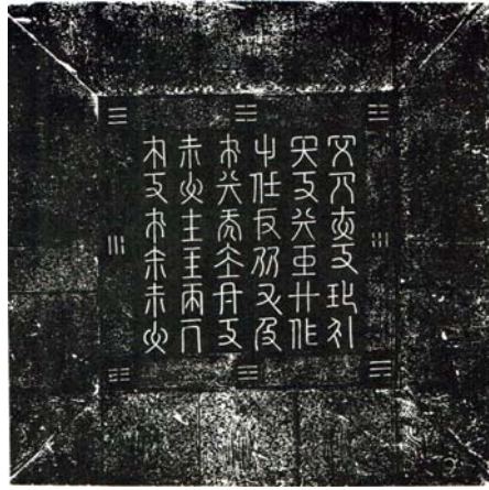
The lid of Daozong huangdi aice