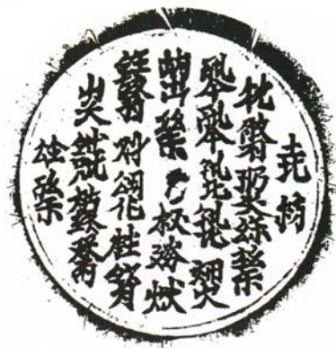
Bronze mirror found in Kaicheng