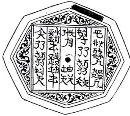
Wanyan Tong Bronze Mirror

The following table of khitan small characters were edited according to the order of the beginning strokes as horizontal、upright、aside、dot、fold. Whereas the pronunciations and the meaning of khitan small characters are basically according to the “index of graphs” in the book of Daniel Kane (pp.301-305, 2009).