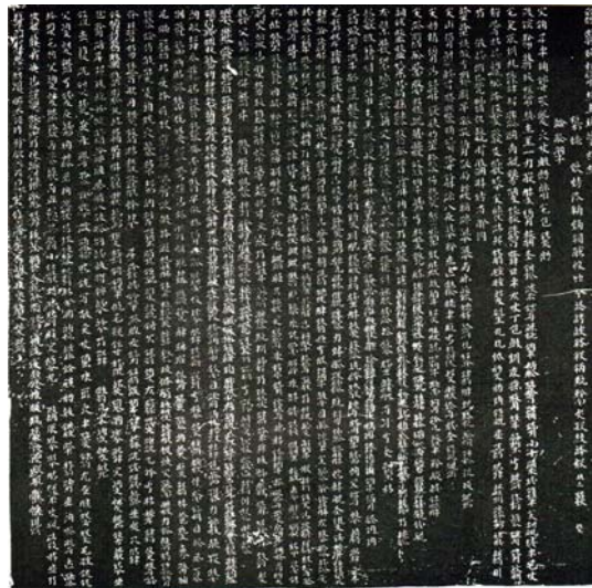
Daozong huangdi aice