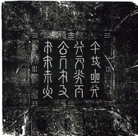
Lid of Xuanyi huanghou aice