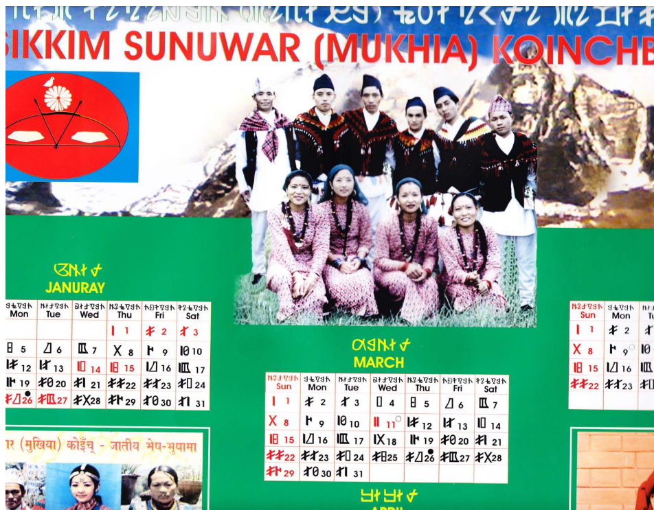
Figure 13: An excerpt from a 2009 wall calendar in Jenticha published by the Sikkim Sunuwar Mukhia Koinchbu.