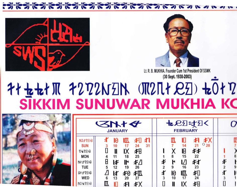
Figure 14: An excerpt from a 2010 wall calendar in Jenticha published by the Sikkim Sunuwar Mukhia Koinchbu.