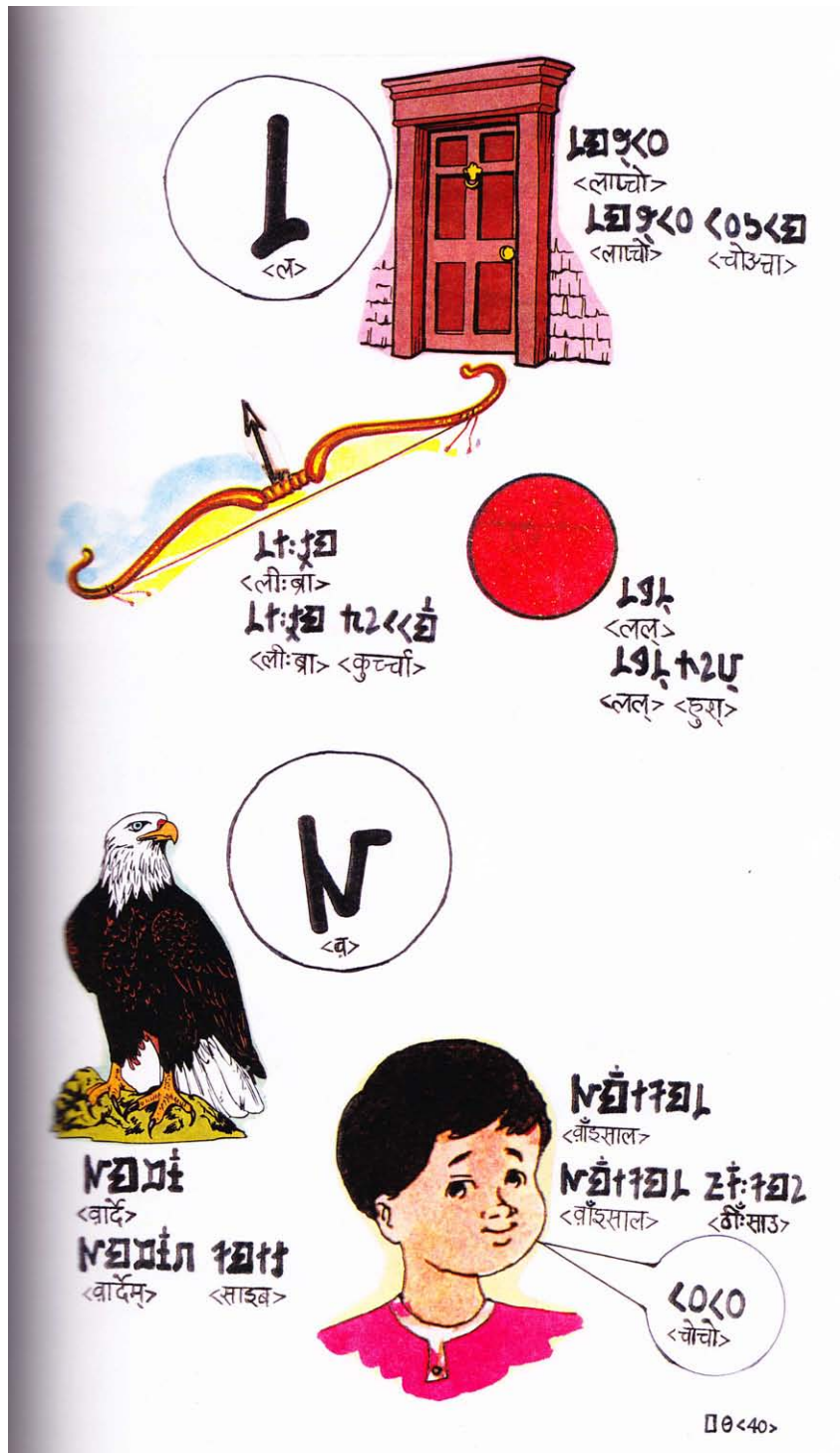
Figure 6: Excerpt from the Elementary Reader of Sunuwar showing example words beginning with LA and N VA (from Mukhia, Mukhia, and Rapaca 2004: 40).