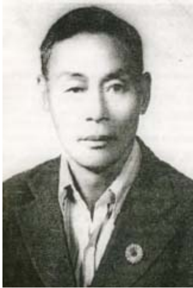
Figure 2: Krishna Bahadur Jenticha (Sunuwar), the inventor of the Jenticha script.