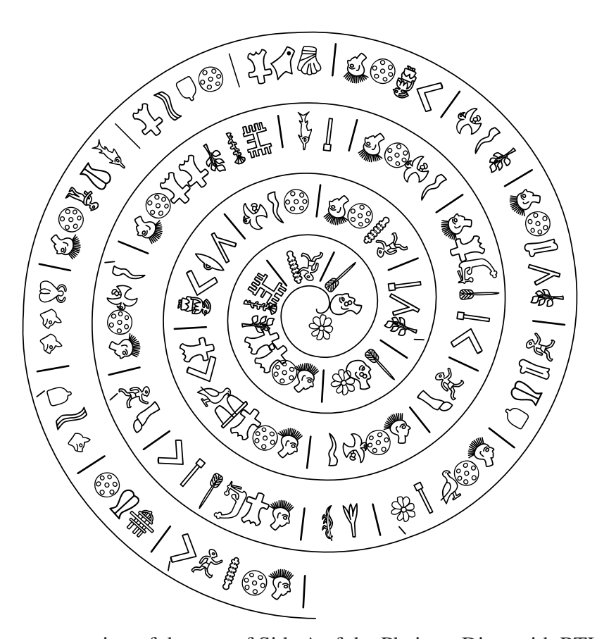
Figure 4. A typeset version of the text of Side A of the Phaistos Disc, with RTL directionality.