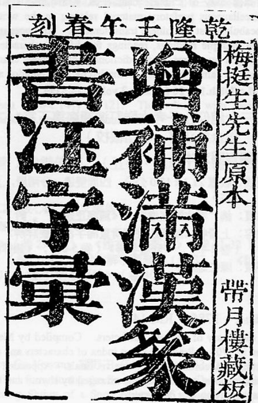
Zengbu Man-Han zhuanzihui 增補滿漢篆字彙 (RM CK494.13 166): title-page.