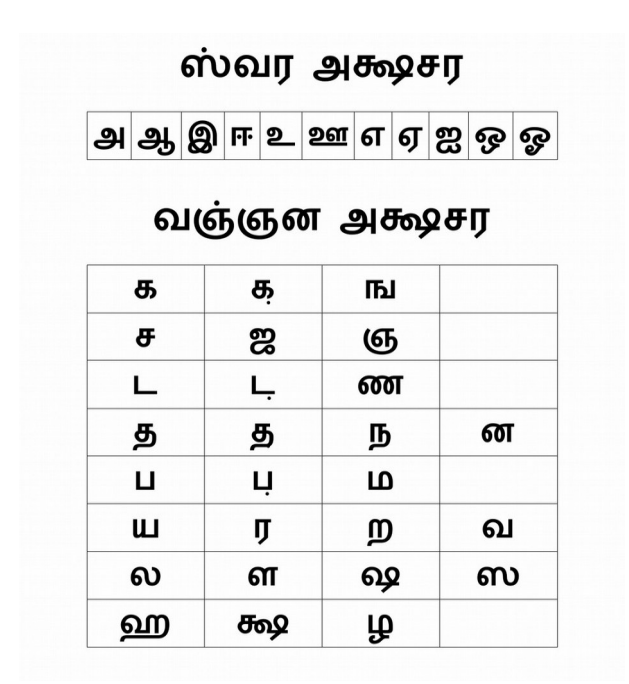
Illustration 1: Chetti alphabet from spelling book