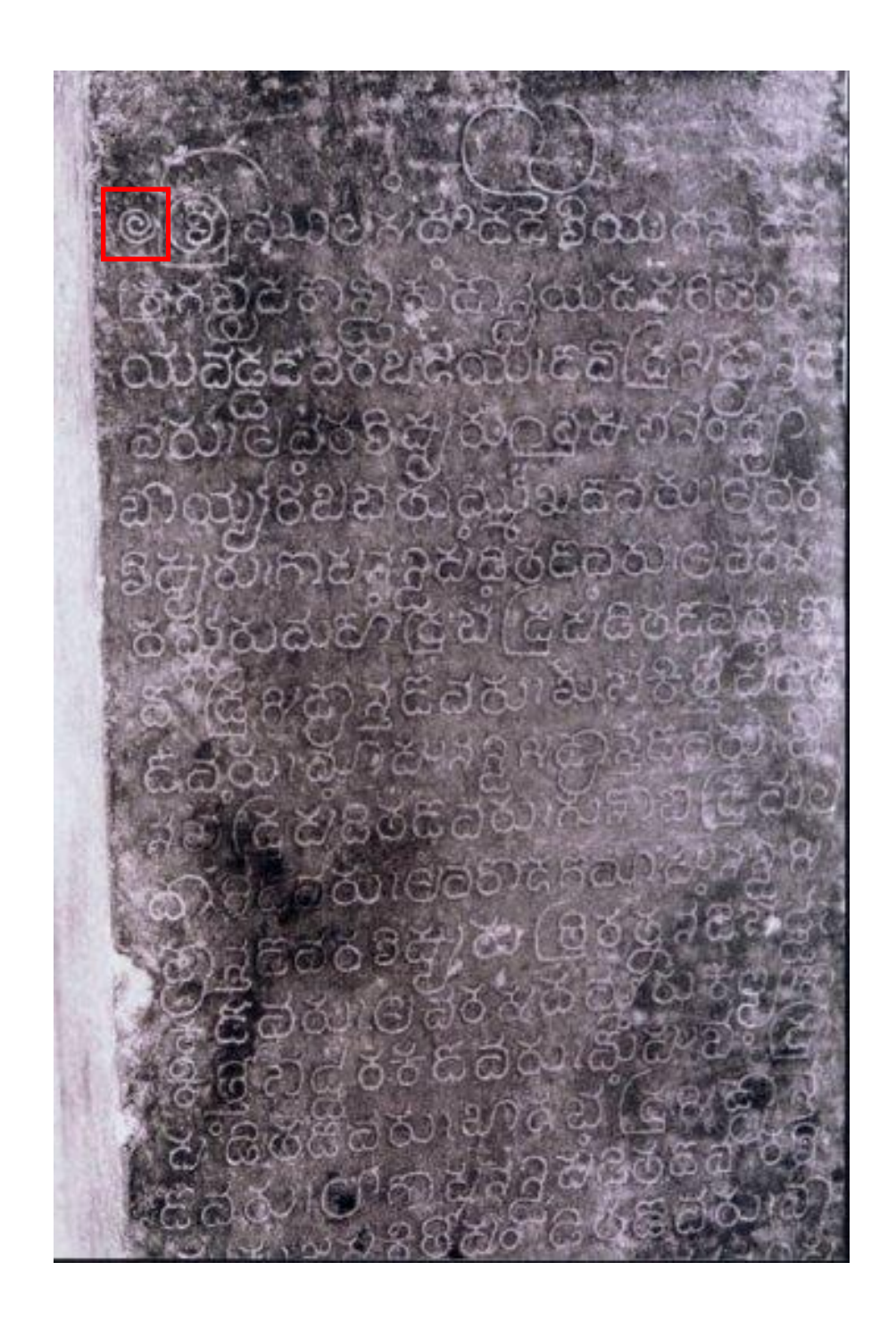
Figure 3: A stone inscription from Shravanabelagola showing the use of Siddham sign.