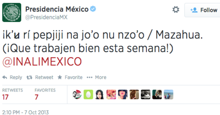
Figure 5: Example from Twitter.