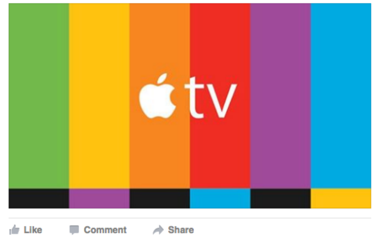
Figure 3: Social media posts by Apple's App Store accounts highlight the absence of an orange heart emoji.

https://www.facebook.com/AppStore/photos/a. 10150245610459421.336770.286893159420/10153771747389421/ https://twitter.com/appstore/status/666725488442802176