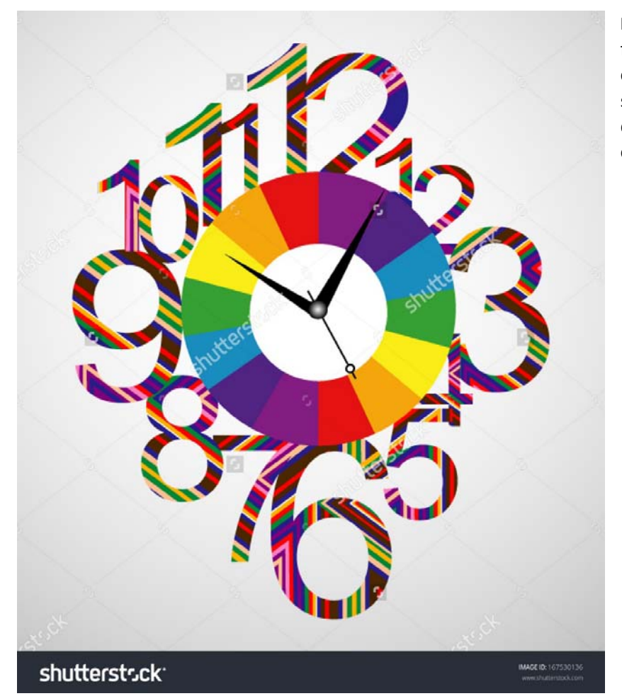
Figure 2 . Another less complex face: Note that we can still cannot compose 10, 11, or 12, since the number 1 and 2 are differently sized in different contexts.