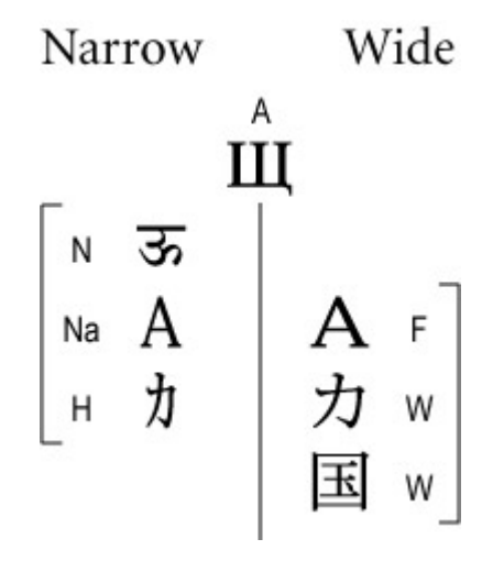
Figure 2. Examples for Each Character Class and Their Resolved Widths

In a broad sense, wide characters include W, F, and A (when in East Asian context), and narrow characters include N, Na, H, and A (when not in East Asian context).