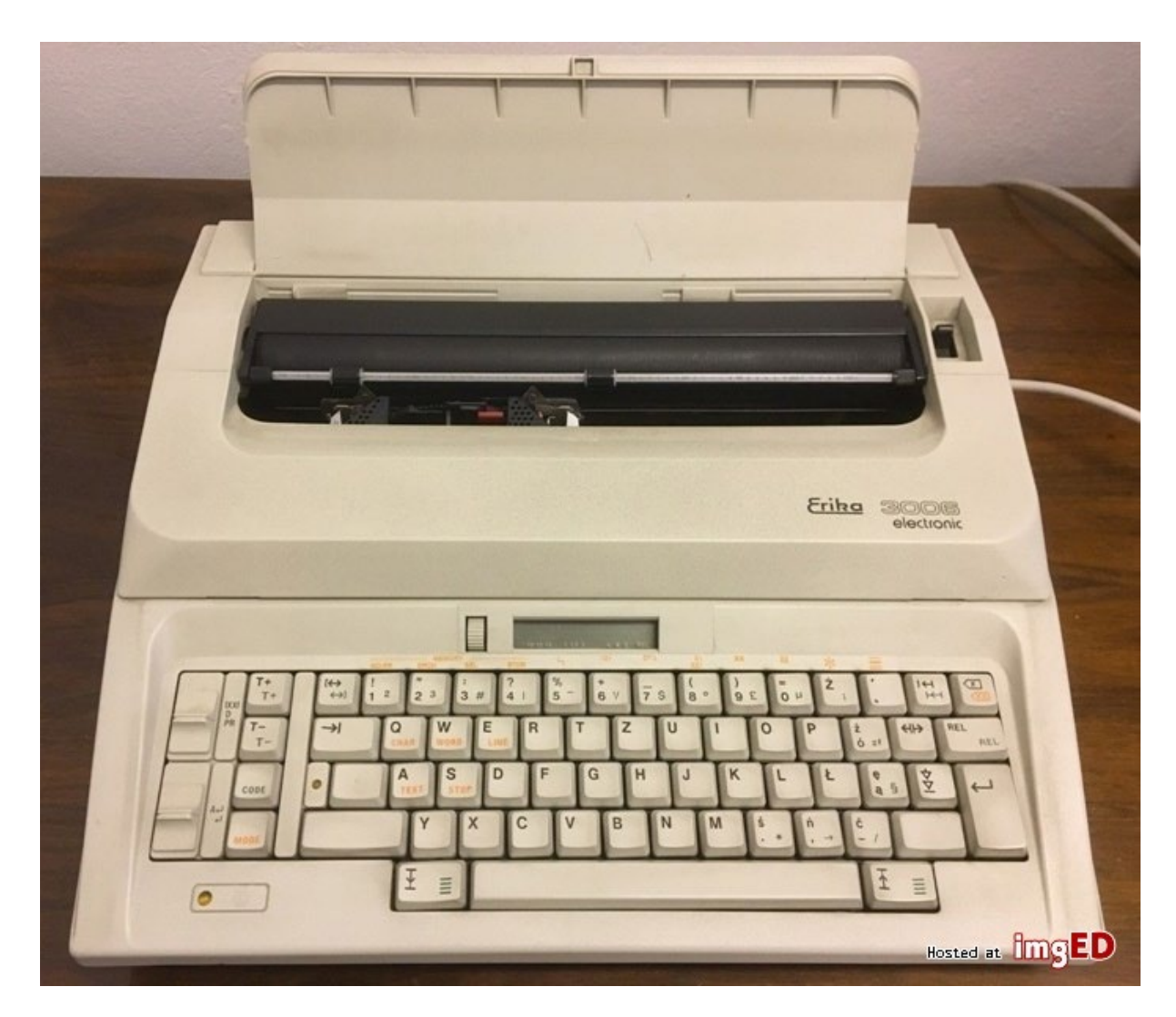
Typewriter Erika from 1990s, symbol "zł" is right of "P" key