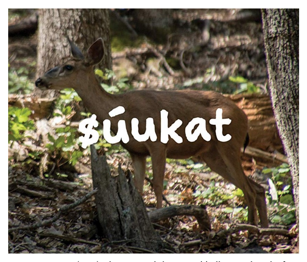
Figure 3. Basquez (2018). The proposed character \langle s \rangle illustrated on the front cover of a Luiseño primer.