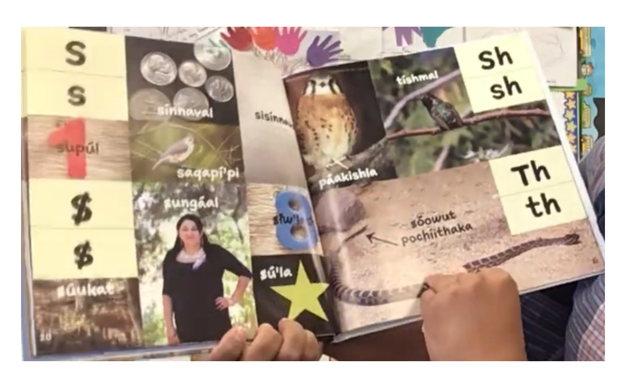
Figure 1. Hill (2005: 14), illustrating the Cupeño digraph ($h $h)

b. as coda: ashwet 'eagle' Sheshwayvelpa 'Santa Ysabel' (place name)