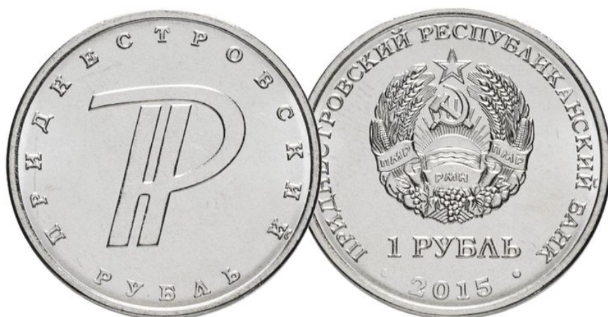
Figure 3. The logo of one of the Transnistrian collection sites, where the sign of the Transnistrian ruble is used instead of the CYRILLIC CAPITAL LETTER ER