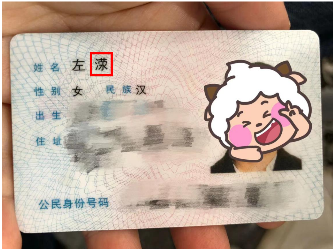
Fig. 4 Ms. Zuǒ Yíng's ID card