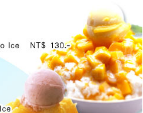
Mango and Strawberry Ice