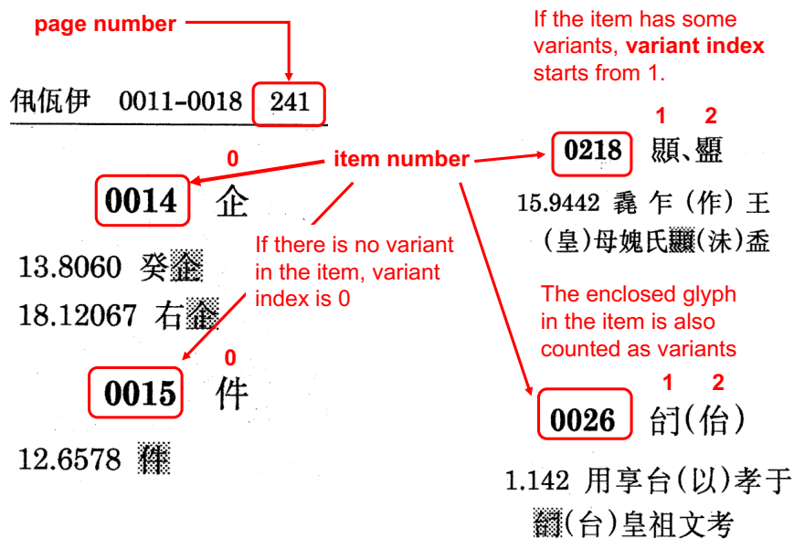
Figure 2: page, item and variant number for 殷周金文集成引得

The source information I propose is GZJW_dddd.d. The first 4 digits are for the item number and the last digit is for the variant number. The definition of the item and variants number is shown in Figure 2. I've already the drafted the mapping table between existing GZJW_ddddd source info and the item number, variant index and page number, see attached PDF and CSV.