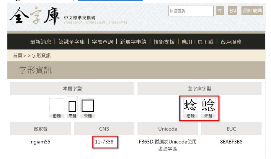
Fig. 2 TB-7338, CNS 11643 Web