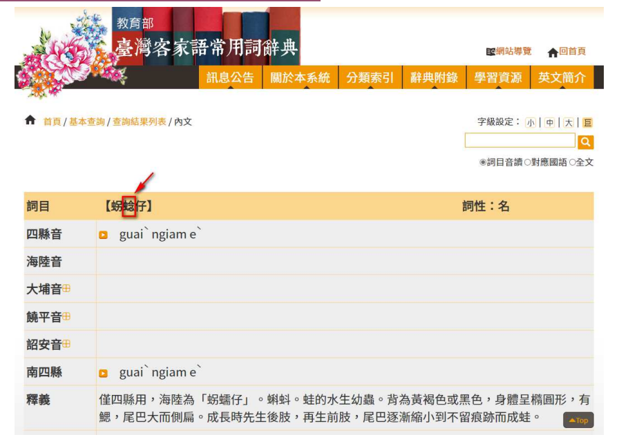
Fig. 3 TB-723F, CNS 11643 Web