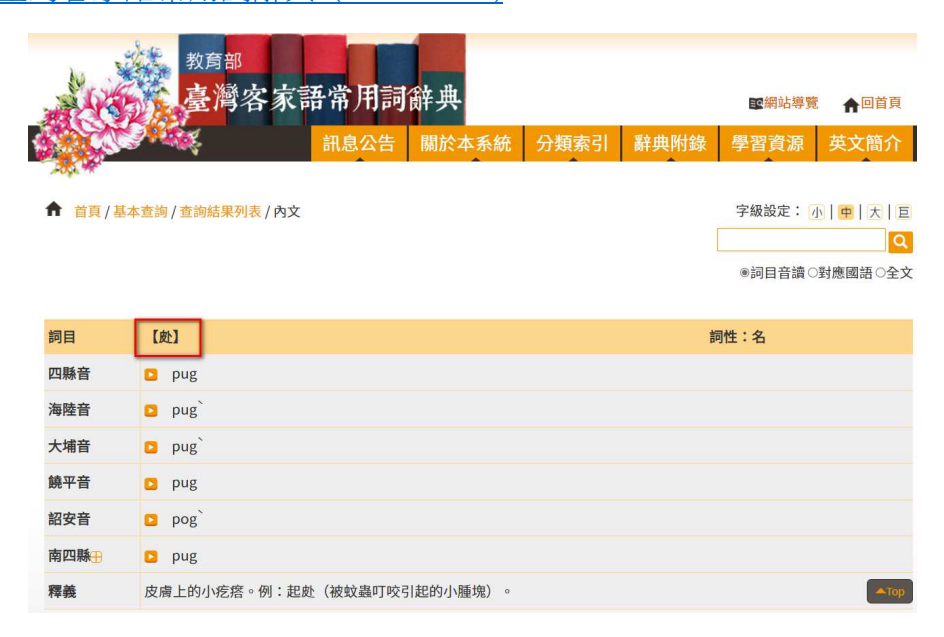
Fig. 4 TA-6054, CNS 11643: 2007