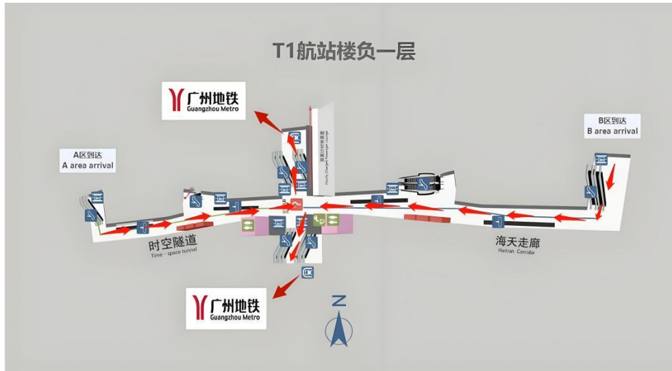
广州白云国际机场外部交通 GUANGZHOU BAIYUN AIRPORT TRAFFIC MAP