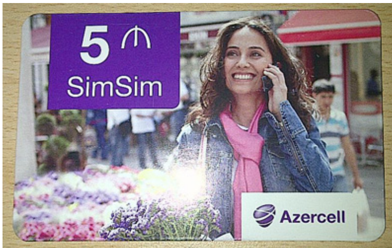
Fig. 9: An example of use, retrieved 2013-06-10 from: http://i.imgur.com/WPH7irG.png