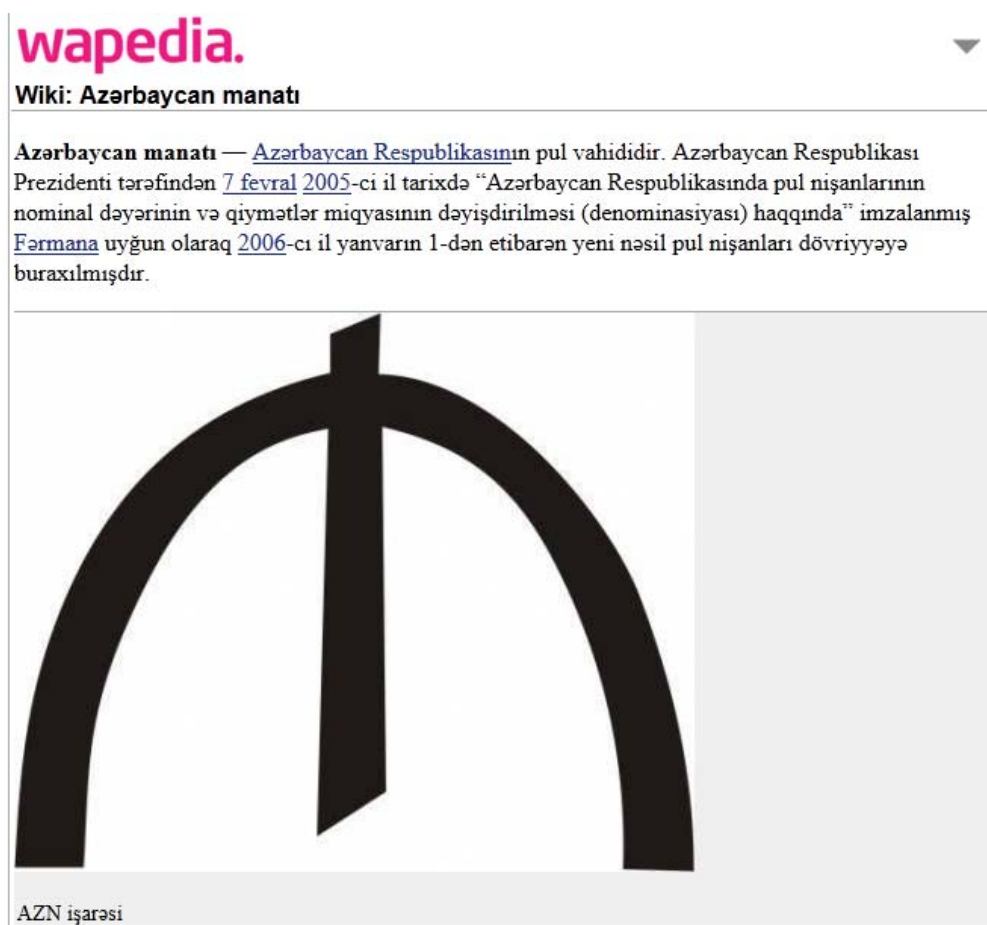
Fig. 1: From http://wapedia.mobi/az/Az%C9%99rbycan_manat%C4%B1 (retrieved 2011-11-10).