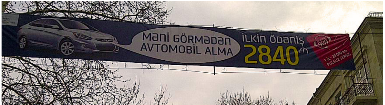
Fig.8: An example of use, retrieved 2013-06-10 from: http://i.imgur.com/8TkSKs7.jpg